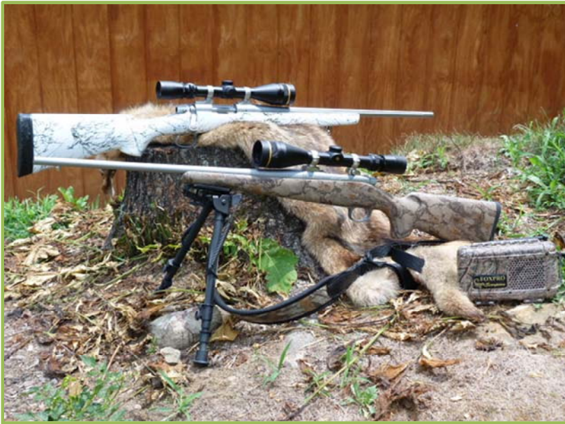
My custom 17 Tactical in the Remington Model Seven and 20 Tactical in the Remington Model 700 LV (White camo stock) are ready for this predator season!

This gun in 20 Tactical has proven deadly on coyotes and does it shoot! The money spent having Greg perform his "accuracy magic" is worth every penny!