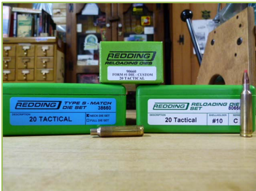
The Woodchuck Den stocks everything you need and has the precision reloading and field experience for your 20 Tactical projects!

My 17 Tactical started life as an all stainless Remington Model Seven in 223. I sent it off to Douglas Barrels and had them install a 1/9 twist stainless steel barrel in 17 Tactical with the exact same contour of the original barrel so it would go right back into the original stock. The barrel was matte finished to match the original action. This super lightweight and fast handling rifle is my favorite predator rifle. It moves our 30-grain Gold bullets at over 4000 f.p.s. with only a 20-inch barrel. Now that is screaming performance and any predator out to 500 yards is in extreme danger!