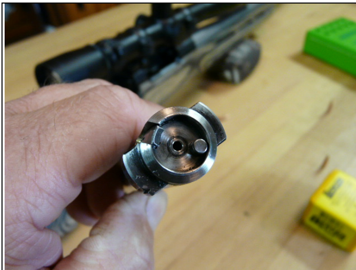
Dwight Scott trued the bolt face and coned the bolt.

The 20 Titan with match ammo has just shot awesome. Using the 55-grain SPL coated Berger bullet, I have reached over 3600 fps with five different powders and was able to shoot a tad over 3750 fps with one of those five powders. If you have a rifle with a PPC bolt face, you can build a 20 Titan and now be capable of reaching 1000 yards! This is all done with an inch and a half long case and around 30 grains of powder!!