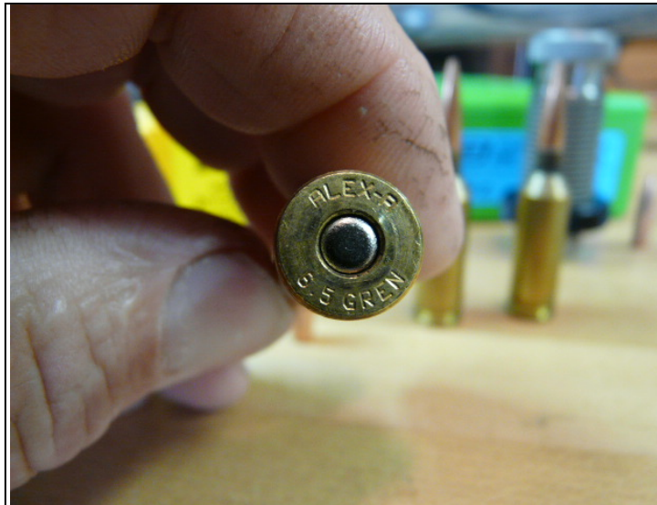
The parent case for the 20 Titan is the 6.5 Grendel.

Once I had the 20 Titan back, I formed some Lapua 6.5 Grendel cases that Bill Alexander had given me to 20 caliber. By using several bushings in a Redding 20 PPC Type-S full-length die, I was able to form the Lapua 6.5 Grendel cases down to 20 Titan. (For those of you not familiar with the 6.5 Grendel, it's actually very similar to the PPC case but the 30-degree shoulder is moved forward to create more case capacity and it is 6.5 caliber. The case is precision made by Lapua with a small primer and small flash hole) After a quick light, neck turning, the cases were ready to fireform. I use the Redding 20 PPC Type-S Match dies set up a little off the shell holder to load the 20 Titan.