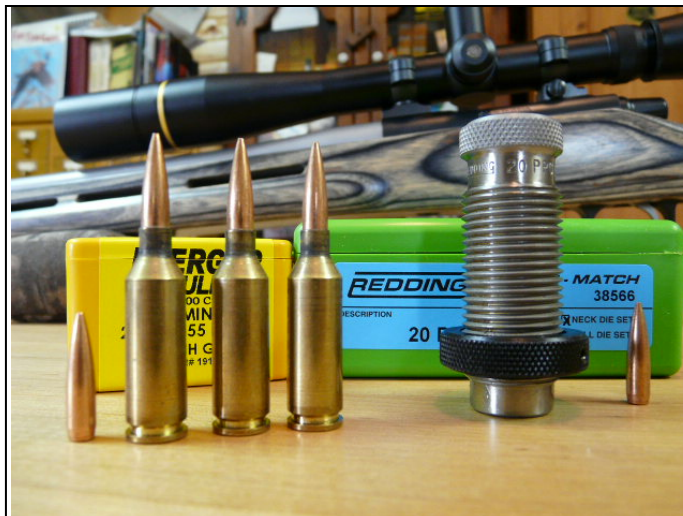
The 20 Titan and Berger 55 grain.

The 20 Titan with match ammo has just shot awesome. Using the 55-grain SPL coated Berger bullet, I have reached over 3600 fps with five different powders and was able to shoot a tad over 3750 fps with one of those five powders. If you have a rifle with a PPC bolt face, you can build a 20 Titan and now be capable of reaching 1000 yards! This is all done with an inch and a half long case and around 30 grains of powder!!