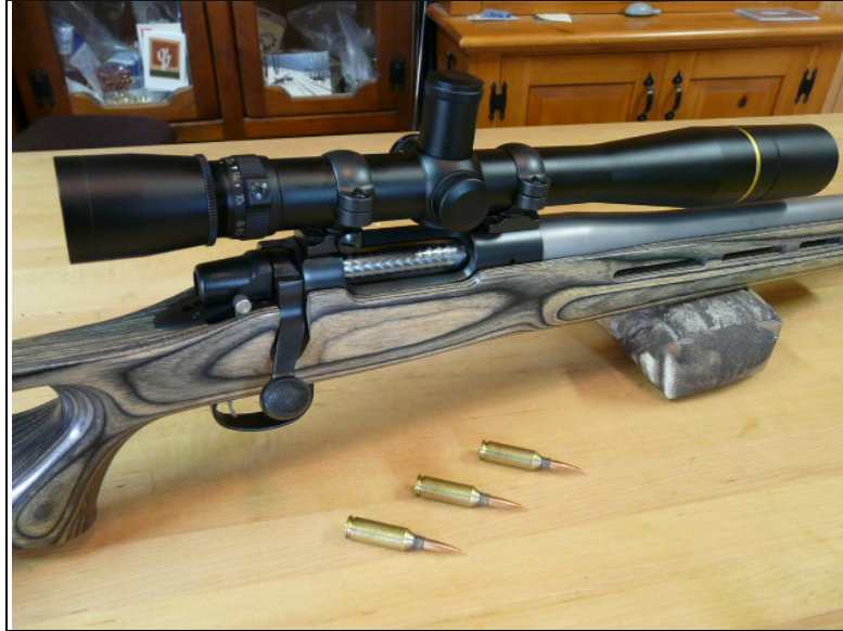
My custom Remington XR-100 in 20 Titan.

I do believe this case has a very bright future in 1000-yard competition and long-range varmint and predator shooting. I am very impressed what it does with its very modest size. It has everything going for it - match proven cases, match 55-grain Berger bullets with a B.C. very close to .400 .....folks mark my word on this one!!!!