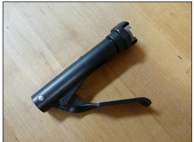
Deluxe Priming Tool

I tell customers almost every day that one of the most important accuracy tools we offer is the Series II Annealing tool . We have been selling this tool to precision shooters for over fifteen years now. We sell them to many small caliber, bench-rest, 1000 yard, and even lead bullet shooters - all trying to achieve longer case life and improved accuracy. Annealing is so important if done correctly. The problem is that most people do not anneal correctly - they simply overheat the brass. This tool encircles the case with a moderate flame that heats uniformly without overheating the brass. Remember a propane torch has two major problems. It runs too hot and only comes from one direction. The Series II Annealing tip, which slides onto the basic propane torch encircles the case with a uniform flame and heats the brass slowly and uniformly. At only $45.00 plus shipping, what a perfect little gift for the precision reloader!