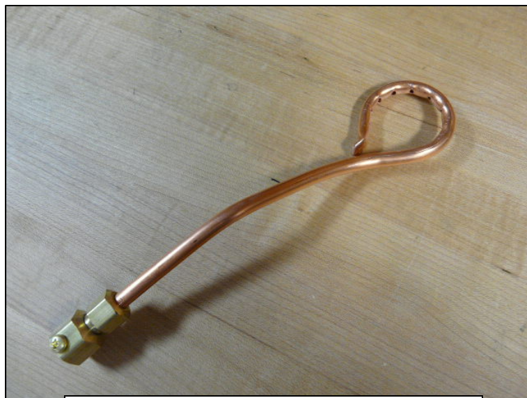
Series II Annealing Tool

I tell customers almost every day that one of the most important accuracy tools we offer is the Series II Annealing tool . We have been selling this tool to precision shooters for over fifteen years now. We sell them to many small caliber, bench-rest, 1000 yard, and even lead bullet shooters - all trying to achieve longer case life and improved accuracy. Annealing is so important if done correctly. The problem is that most people do not anneal correctly - they simply overheat the brass. This tool encircles the case with a moderate flame that heats uniformly without overheating the brass. Remember a propane torch has two major problems. It runs too hot and only comes from one direction. The Series II Annealing tip, which slides onto the basic propane torch encircles the case with a uniform flame and heats the brass slowly and uniformly. At only $45.00 plus shipping, what a perfect little gift for the precision reloader!