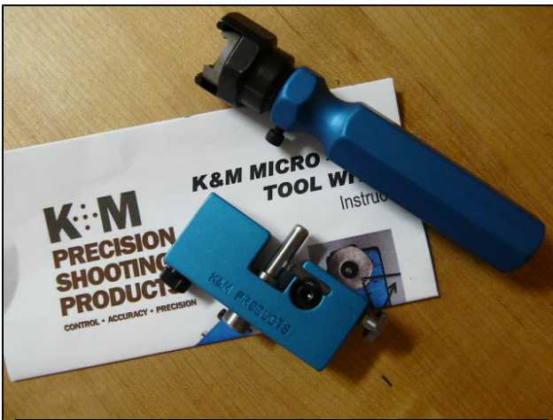
K & M Micro-Adjustable Case Neck Turner

is well made of solid steel and is very compact. I love the superb “feel” when seating a primer correctly and this tool has that special “feel” which is so important.