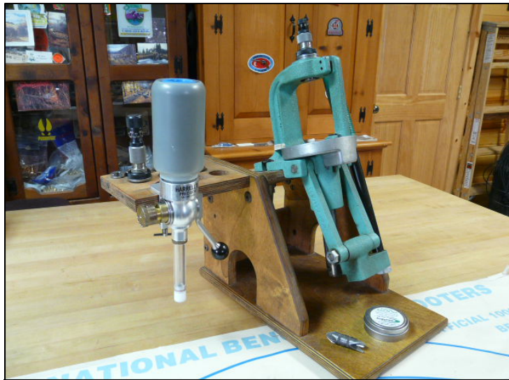
Woodchuck Den Portable Table Top Reloading Stand

Finally yet importantly, is our Portable Table Top Reloading Stand that we have been discussing. We have been selling these over 15 years to customers all over the world! I ask shooters all the time why would you tie yourself down to your reloading room when you can load anywhere there is a table or a tailgate? I load in our great room in the winter by the stove, on the deck, and at the range in the summer. Even if you have a large reloading room, why would you want to clutter your benches and tables with reloading presses? Once you're done reloading, you can store your press under the bench or in the closet! For only $69.95 plus shipping, this is one gift you will love and appreciate year around!